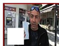
Cyprus faces years of sufferin...