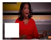
Oprah Voted Forbes Most Infl...